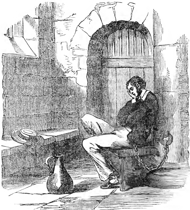
THE BANDIT IN JAIL.